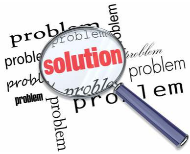
Table Talk Questions