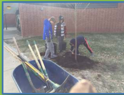
Students partner with Keep Indianapolis Beautiful to plant trees on school grounds