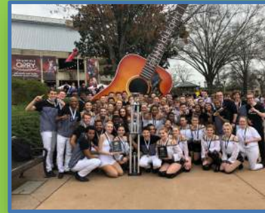
NCHS Counterpoints win state and national titles