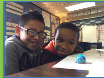
Students participate in Hour of Code