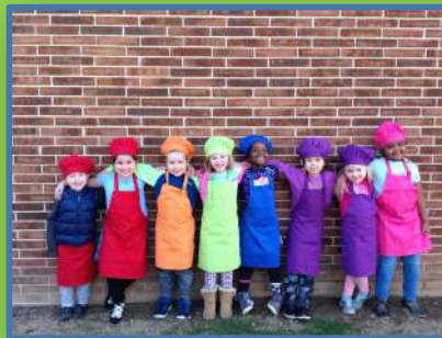
Students participate in Cooking Club