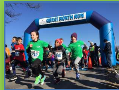
Community raises private dollars for public education at the Great North Run