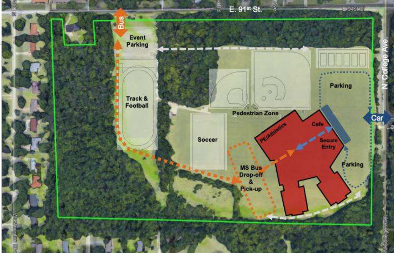
New Construction of Northview Middle School