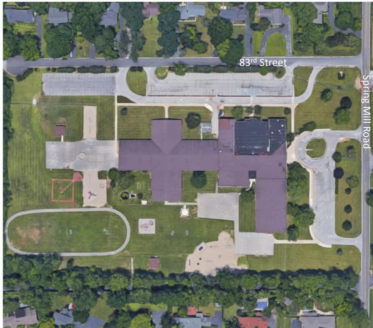
2020 proposed referendum construction scope will occur with minimal disruption to daily school operation and begin with conjunction to 2016 referendum construction scope. Majority of scope is isolated areas and exterior work.