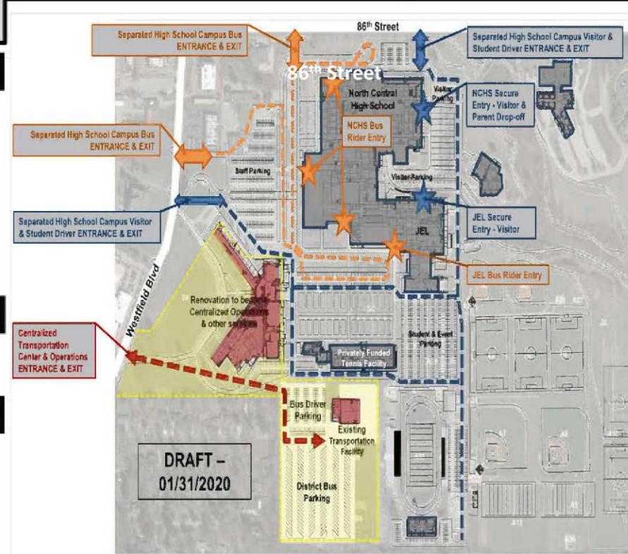
North Central High School DRAFT Plan 1/31/2020 (Operations Service Center/Transportation in yellow box)

2016 Referendum Scope (in Black) Construction Timeline: 2021-2025 $ 34,516,000