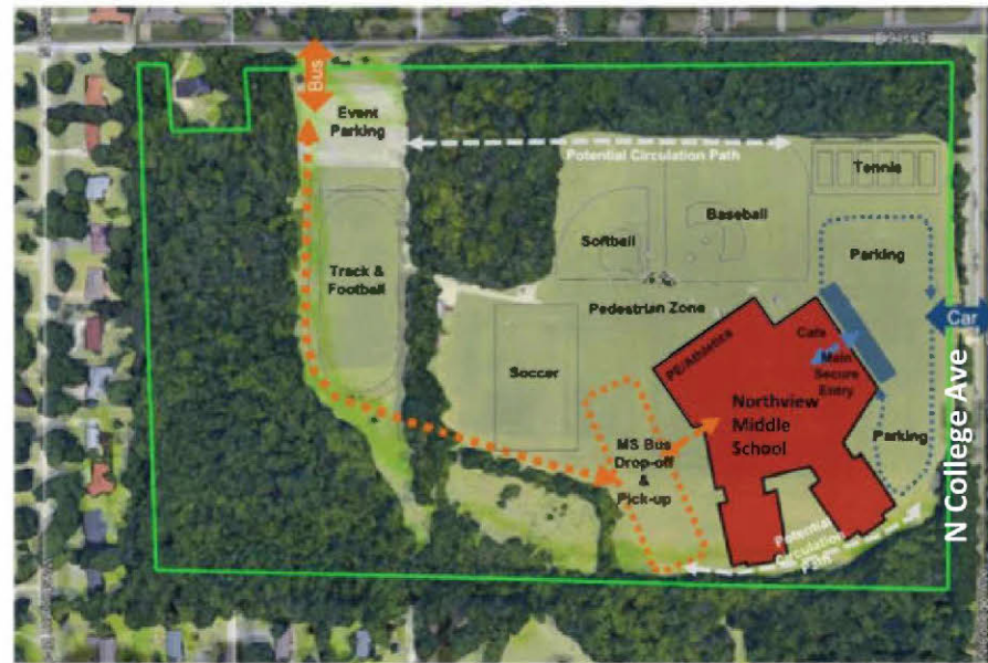
New Northview Middle School to be constructed at 91st & College

2016 construction referendum funds allocated to Northview Middle School will be used to construct a new Northview Middle School site at 91st & College along with 2020 construction referendum funds.