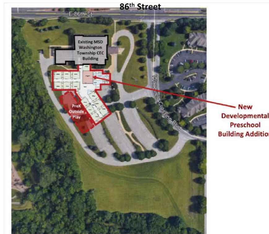
Proposed new site for Developmental Preschool