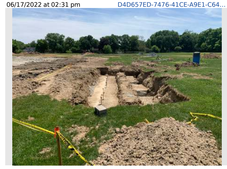
Description North Softball dugout footing