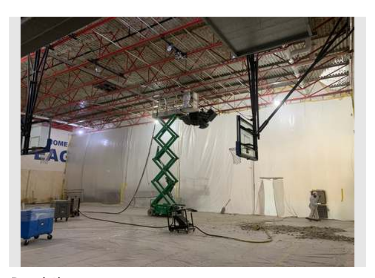
Description East gym North End

Taken DateUploaded By06/17/2022 at 01:51 pmBrad Holland