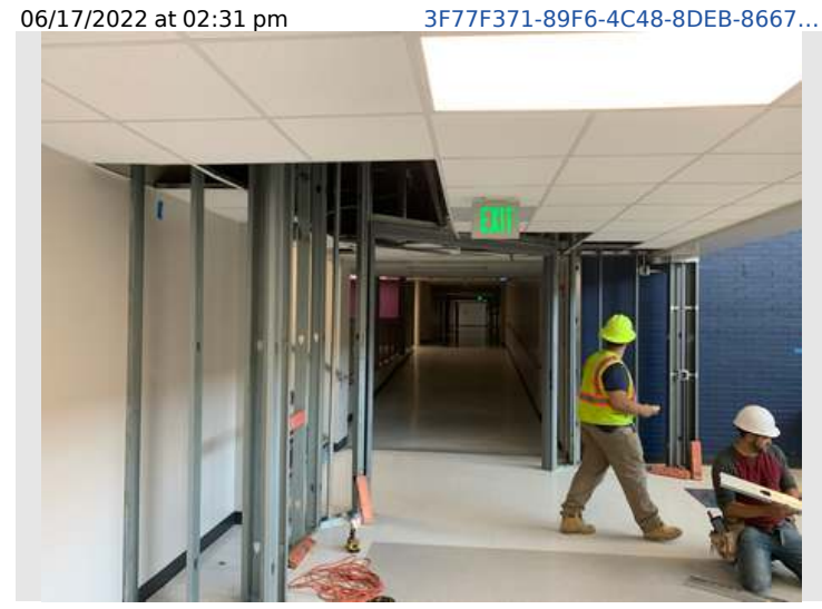
Description Security door opening from Unit C to Unit B

Taken Date06/17/2022 at 02:07 pm