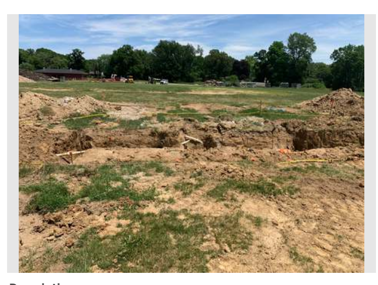
Description South baseball dugout footing