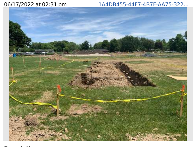
Description West softball dugout ready for concrete footing

Taken Date Uploaded By 06/17/2022 at 02:18 pm Brad Holland Upload Date File Name