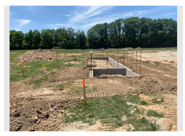
Description East baseball dugout footing

Taken Date Uploaded By Brad Holland 06/17/2022 at 02:20 pm