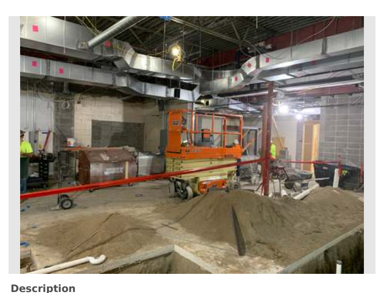
_ . . .