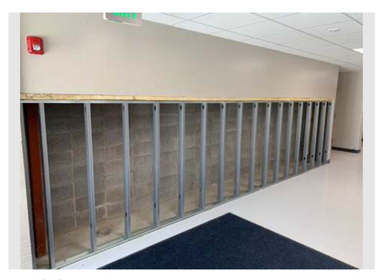
Description Unit D locker infill

Taken Date Uploaded By 06/17/2022 at 02:12 pm Brad Holland