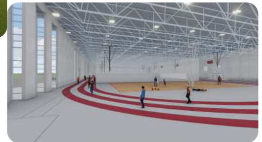
PAUL LOGGAN FIELDHOUSE