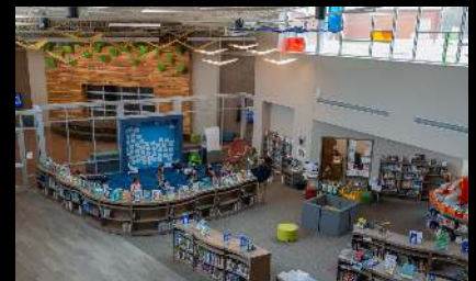
MEDIA CENTER WILLOW LAKE