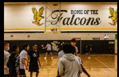
NORTHVIEW MIDDLE SCHOOL PE