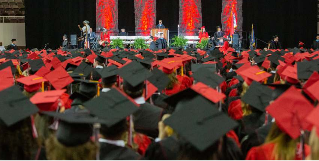
PHOTO: NORTH CENTRAL HIGH SCHOOL GRADUATION