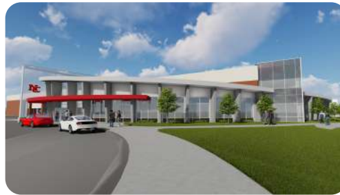
NORTH CENTRAL MAIN ENTRANCE