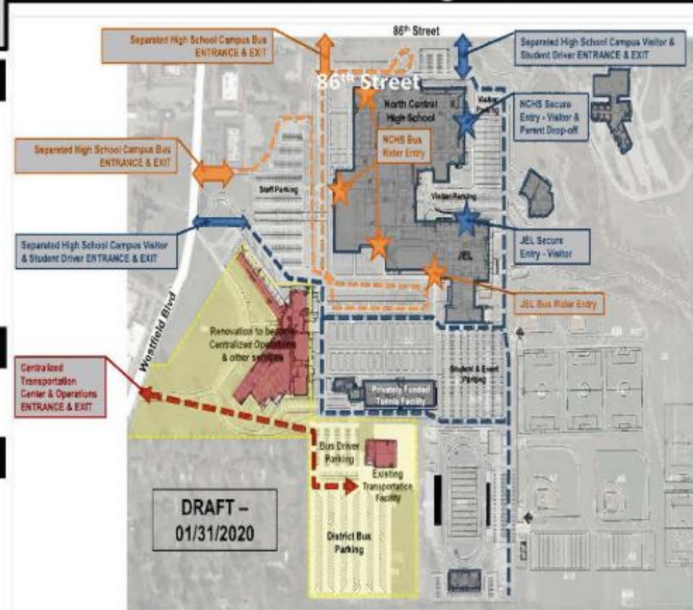
North Central High School DRAFT Plan 1/31/2020 (Operations Service Center/Transportation in yellow box)

2020 Proposed Referendum Scope (in Red) Construction Timeline: TBD $ 128,021,000