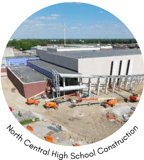
North Central High School Construction